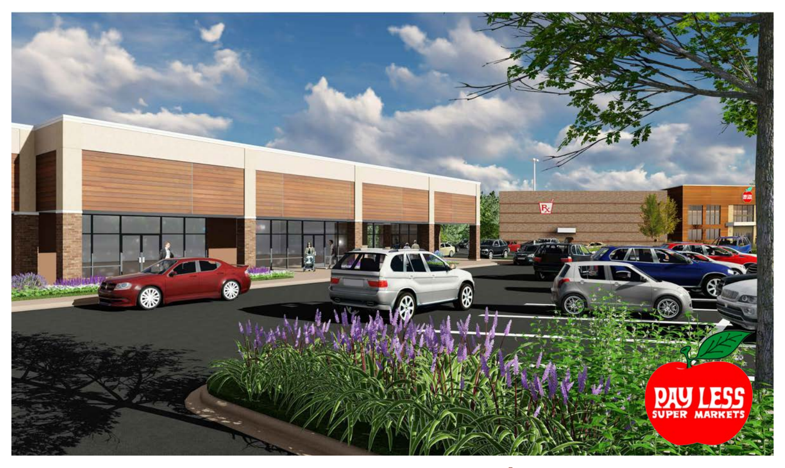
Sagamore Park Centre West Lafayette, IN

Pay Less Super Markets Expanding to 92,052 SF Adding New Fuel Station