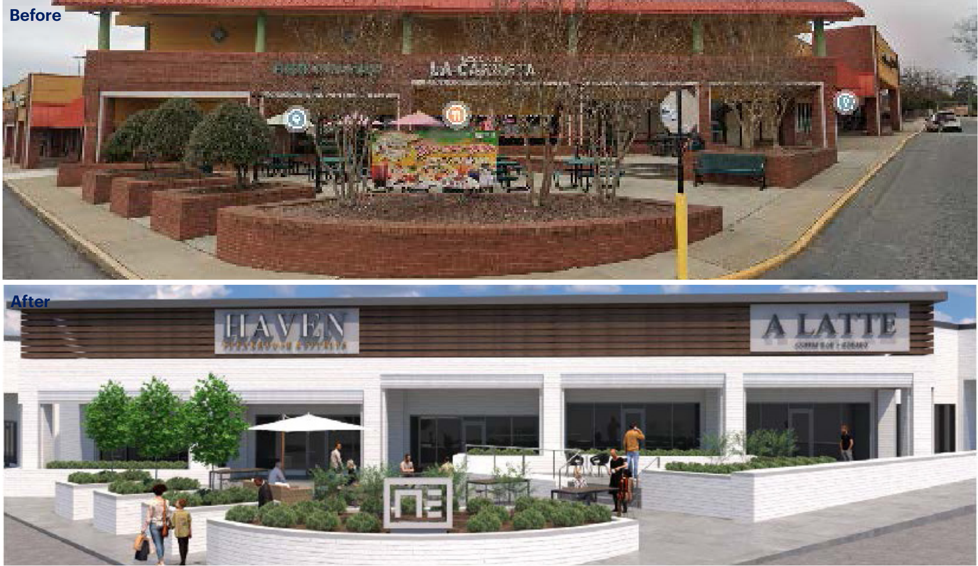
The drawings and images are contemplated to represent design intent and concept only. They are presented at an illustrative level and only to convey overall vision of the project. All design assumption may be re-evaluated as the project progresses to address stakeholder comments/approvals. Lastly, the information contained within these documents are confidential and only information for the intended recipient and may not be used, published or redistributed without the prior written consent of Brixmor Property Group.

Redevelopment will include renovated facades, central gathering places, updated landscaping, LED lighting upgrades, new signage and improved walkability.