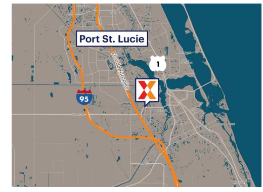
Center Size: 48,937 SF