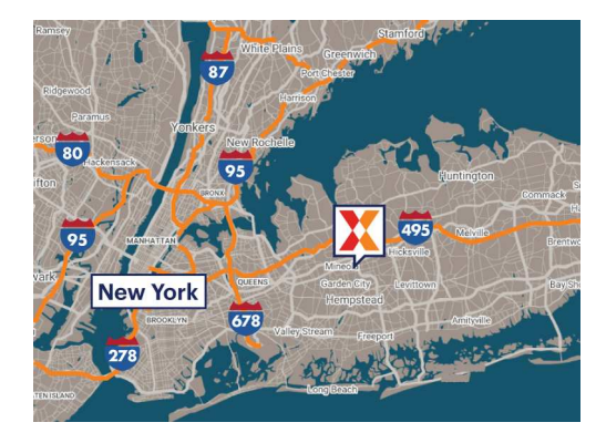
Center Size: 89,749 SF