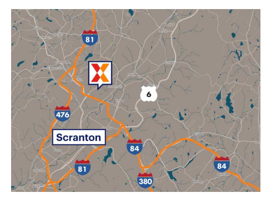
Center Size: 312,355 SF