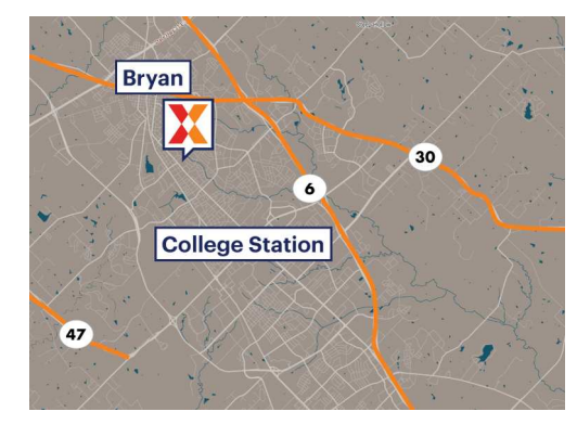
Center Size: 136,887 SF

30.6516, -96.361 1901-2027 South Texas Avenue | Bryan, TX 77802