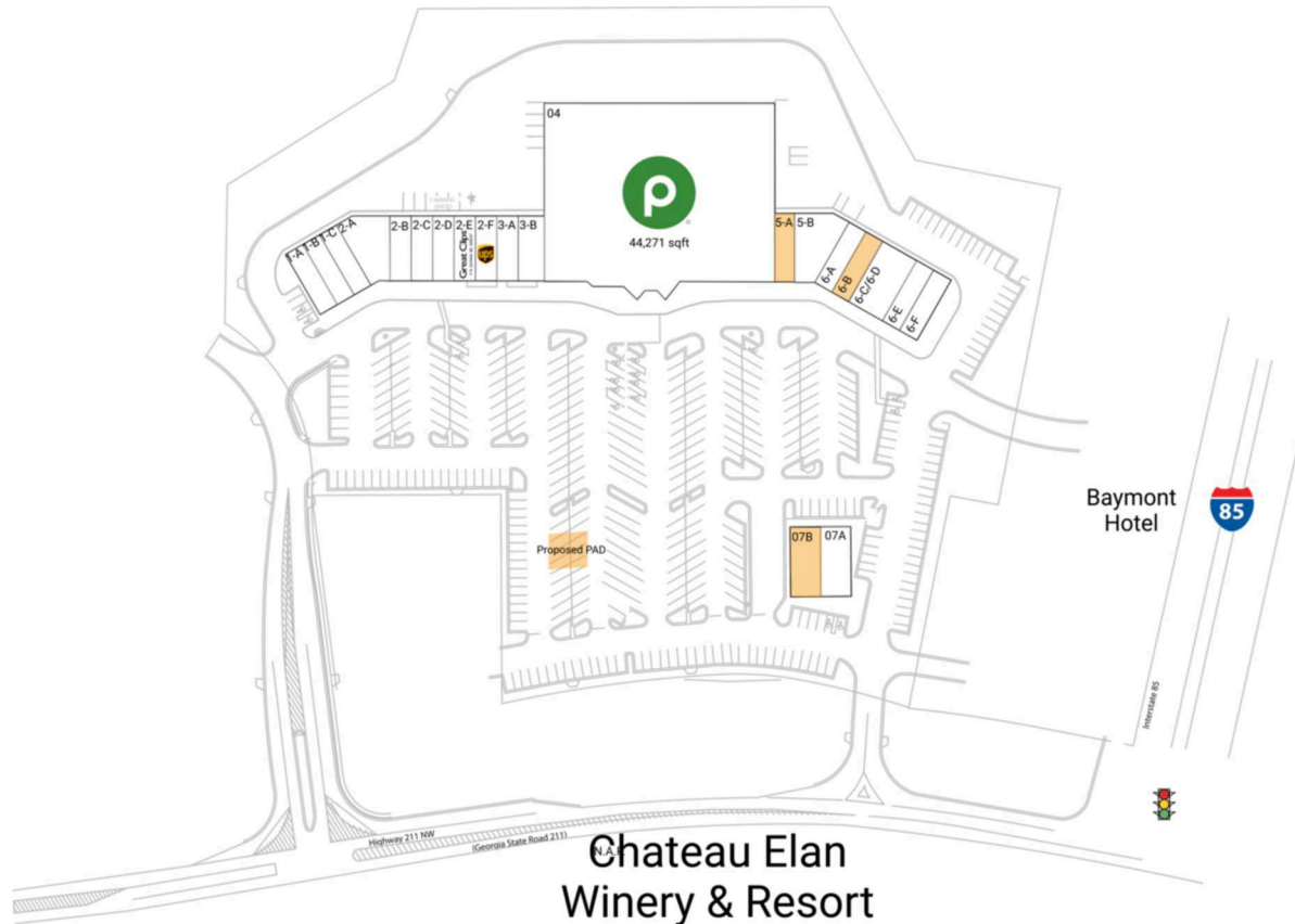
Chateau Elan Winery & Resort

2095 Highway 211 NW | Braselton, GA 30517