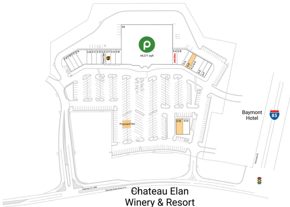
Chateau Elan Winery & Resort

2095 Highway 211 NW | Braselton, GA 30517