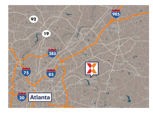
Center Size: 135,865 SF

33.8246, -84.1247 1825 Rockbridge Road | Stone Mountain, GA 30087