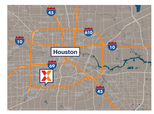
Center Size: 60,136 SF